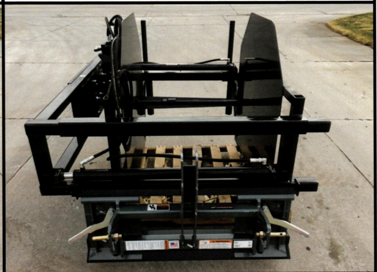
801387 Quick Attach Three Point Adapter