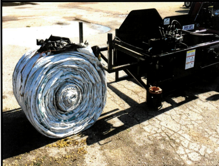
Rolled Grain Bag, Ready for Recycling