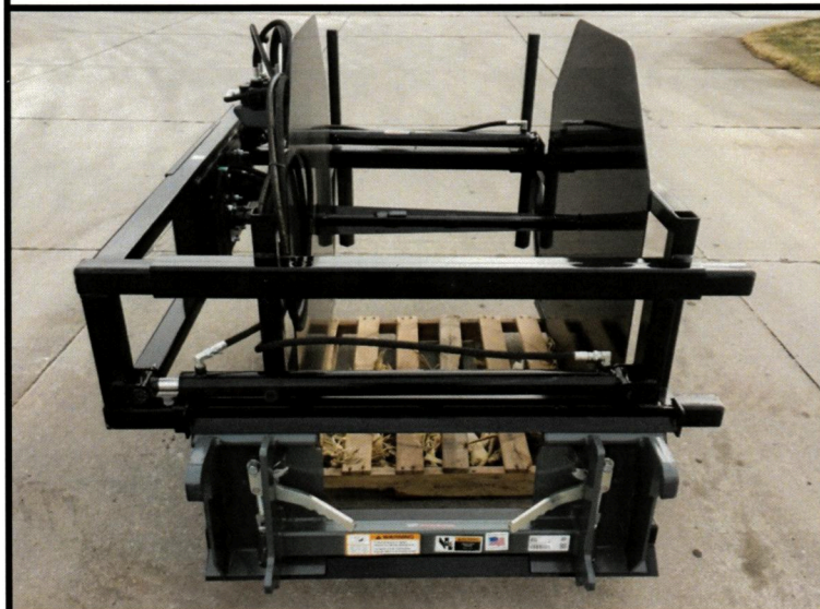
801251 Quick Attach Euro/Global Mounting Plate Adapter