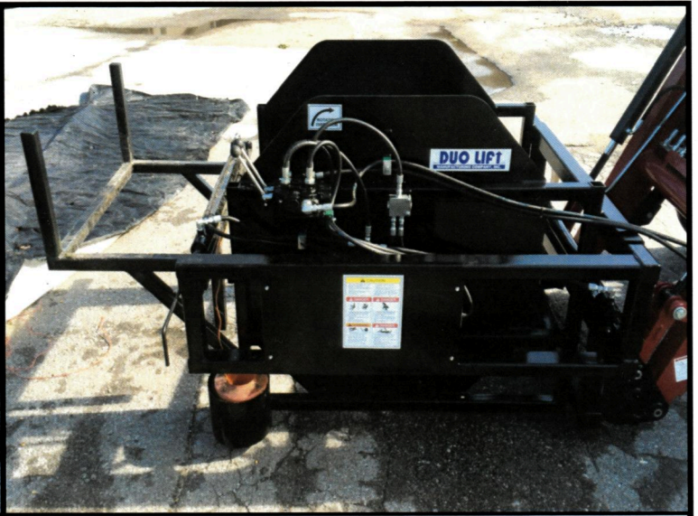
Two Lever Control Valve, Twin Bag Release Cylinders, Twine Ball Canister and Manual Twine Wrapper