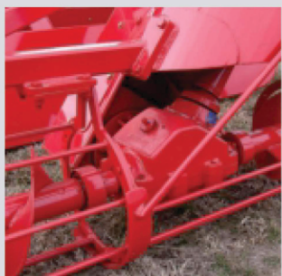
Bottom Angular Gearbox.

AKRON may change specifications and product designs in this or other brochure at any time, without previous notice. Pictures shown are for illustration purposes only.