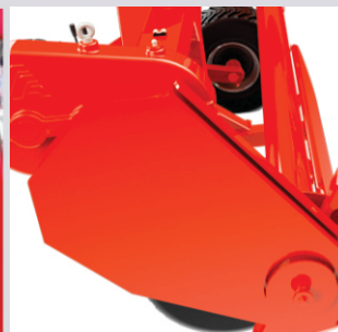
Robust roller transmission.