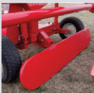
Grain pusher pan improves "end of bag" clean up & performance in tough grain conditions.