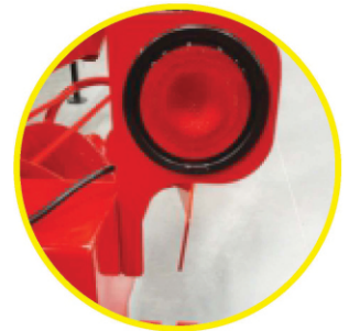
Led Running Lights.