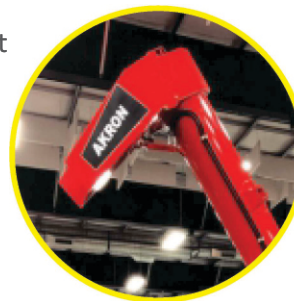
Hydraulic Movable Spout.