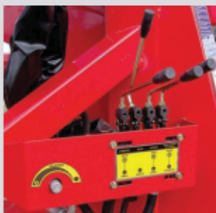
Independent Hydraulic Controls. Speed Control Valve.